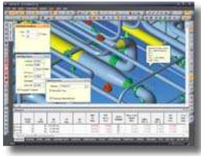
Fig. 2. CAESAR II user interface

CAESAR II makes it easy to input and display all the data needed to accurately define a piping system analysis model. Input can be accessed or modified on an element-by-element basis, or datasets can be selected to make global changes. The CAESAR II input graphics module makes quick work of developing analysis models while clearly indicating areas of concern and providing an excellent idea of the piping system's flexibility. Colour-coded stress models and animated displacements for any stress load case are available. Besides the evaluation of a piping system's response to thermal, weight and pressure loads, CAESAR II analysis the effects of wind, support settlement, seismic loads and wave loads.